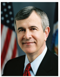
Mike Johanns United States Senator

I hope you take the time to review what these organizations have to offer. Encouragement from parents can be key to students taking that first step to joining an organization.